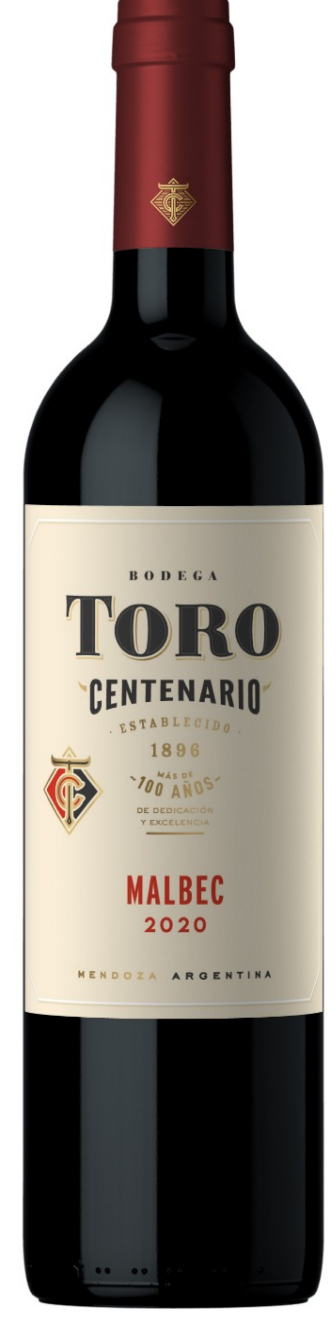
New / Global